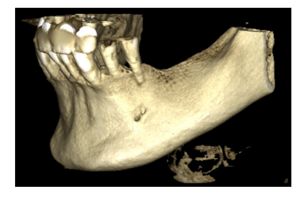
Figure 1: Double mental foramen in a sample patient

women. Solitary left mental foramen was detected in 108 (90.8%) men and 205 (95.3%) women. More than one foramen was detected in 11(9.2%) men and 10 (4.7%) women. No significant differences were found in the anatomic variation of mental foramen regarding to gender in the left (p=0.228) and right sides (p=0.191). 285 patients (93.1%) of 15-45 years old group and 29 (96.7%) of older group had one mental foramen on the right side. On the left side, 285 images (93.8%) of the15-45year-old group and 28(93.3%) of the older group had single mental foramen. Statistical analysis did not show a significant relationship between age and the frequency of mental foramen on the right (p=0.451) and left sides (p=0.929). The incidence of accessory canals in the right and left sides regarding to gender is presented in Table 3.A non-significant relationship was also found between gender and prevalence of accessory canal on the right side (Table 3). A total of 304 patients (91%) were 15-45 (group1) years old and 30 cases (9%) were more than 45 years old (group 2). The accessory canals were not found in 288 (94.7%) patients in the 15-45-year-old group and 28 (93.3%) of the older group. A non-significant relationship was observed between the age groups and prevalence of accessory canals (p=0.745). The